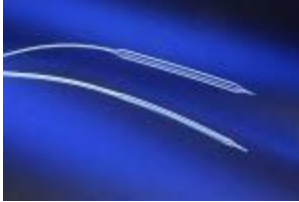
2.8F shaft design